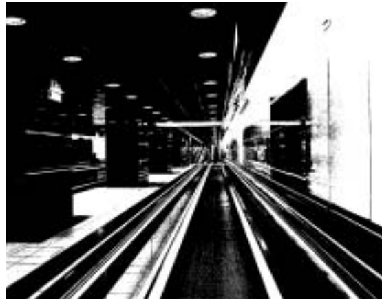
Studies for Time and Space project, 2003