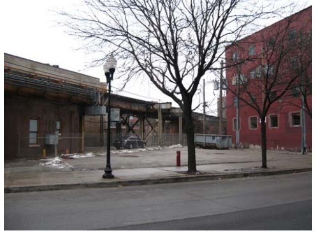
From Franklin Street looking west toward site