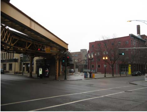
From Chicago Avenue looking northwest