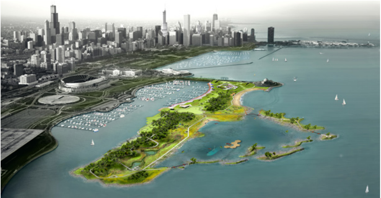
Proposed Ecological Park on Northerly Island

The Northerly Island framework plan currently outlines the future development of Northerly Island into a coastal ecological park. The intent of the framework plan is to create an ecological park that will integrate with the museum campus and provide recreational, environmental, cultural and educational opportunities along this ideal lakefront location.