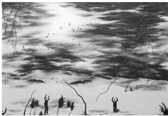
The Pre-Conference with an Unfair Fight in the Back , 2004, pencil on paper, 7.5" x 10"