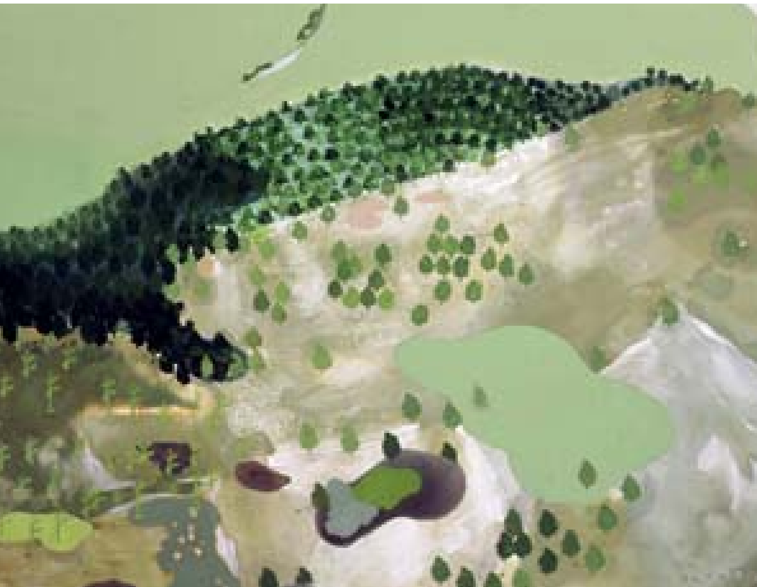
Shona Macdonald, Inscape: Pine (detail), 2004 (diptych), gouache, acrylic and oil on MDF, 52" x 90"