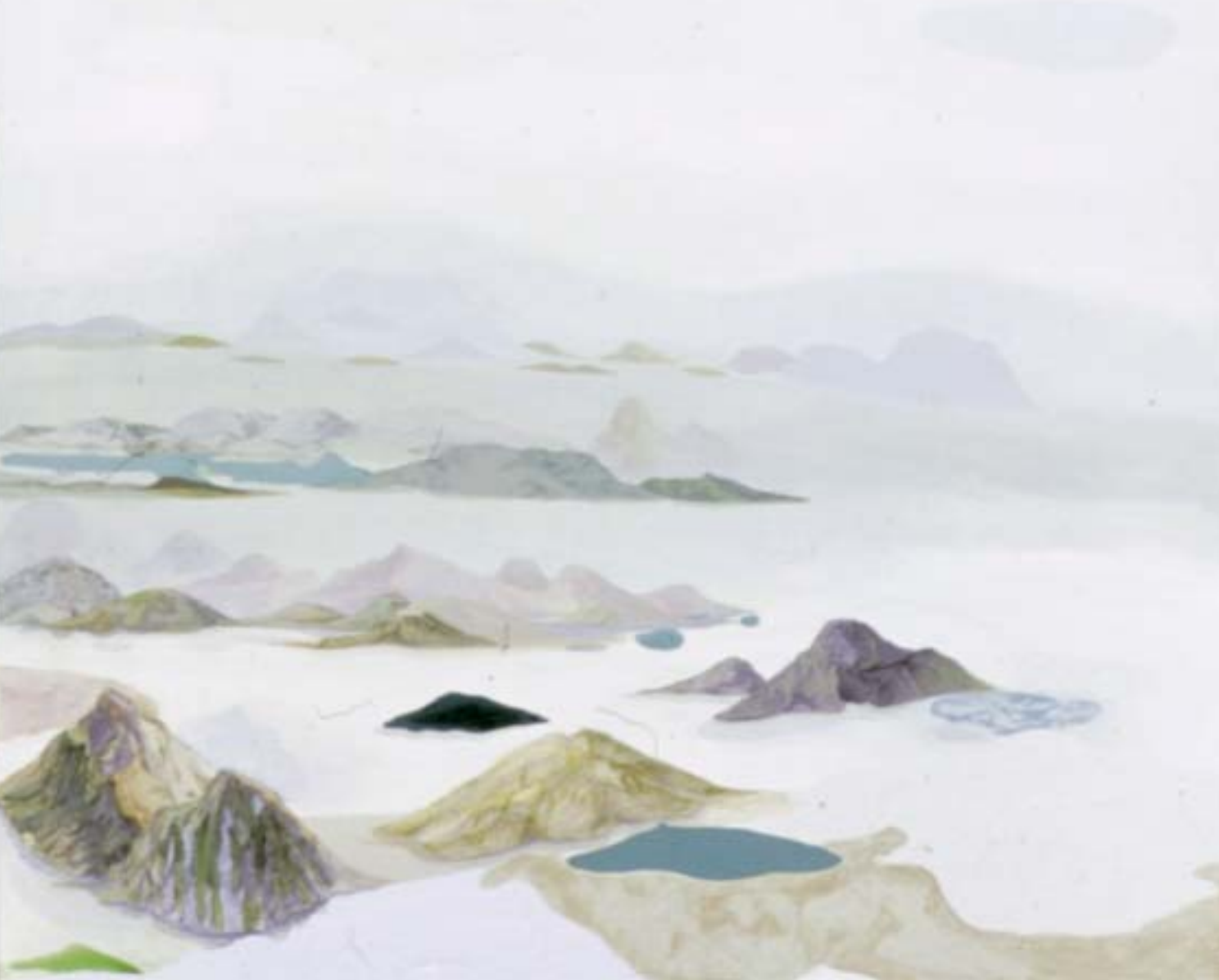
Shona Macdonald, Inscape: Mountains , 2004 (diptych), gouache, acrylic on MDF, 45" x 104"