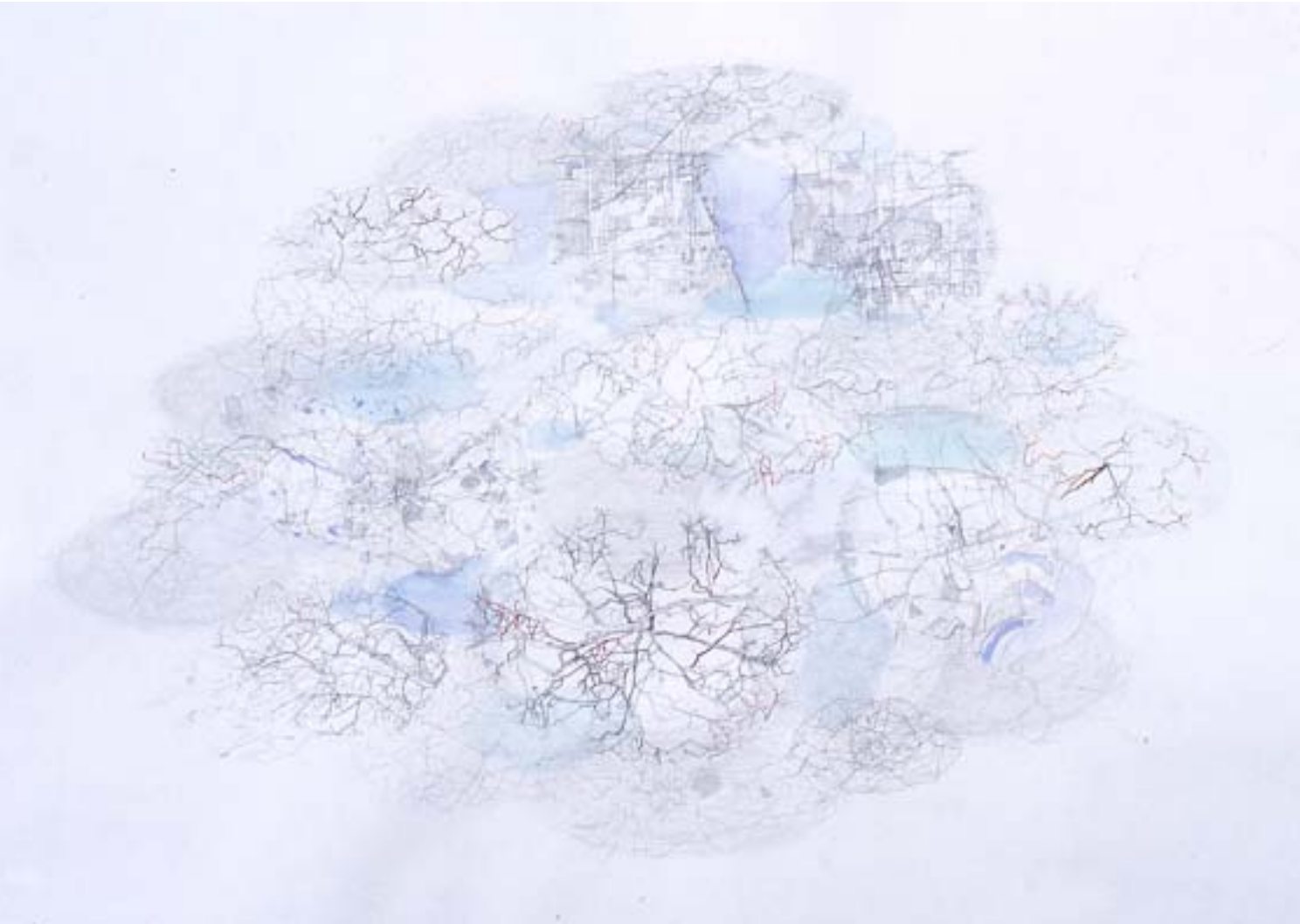
Shona Macdonald, Branches, Portals, Places , 2004, pencil and gouache on paper, 23" x 29"