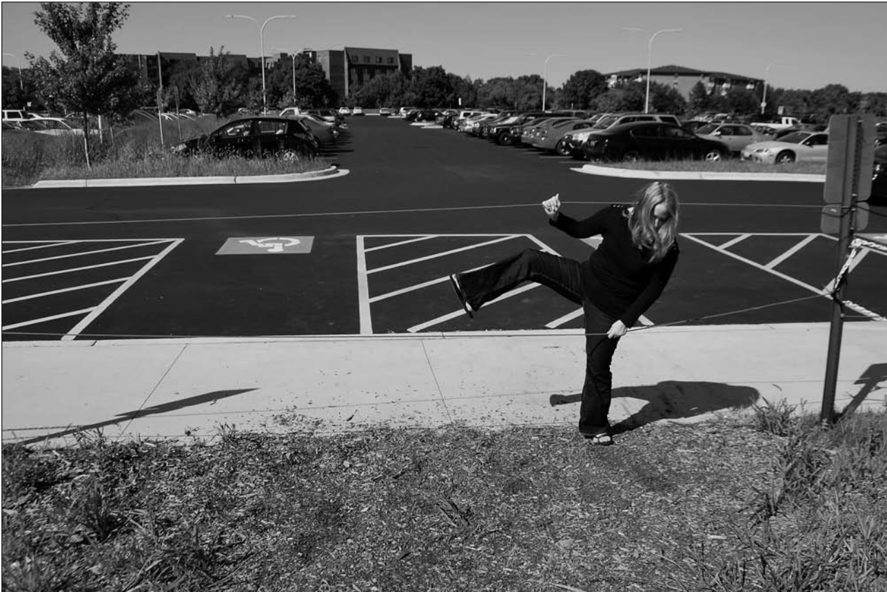
A student climbs over a rope that blocks off the native prairie plants near the MAC (Photo illustration).