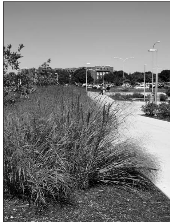
Ornamental grass grows between the BIC and the MAC.