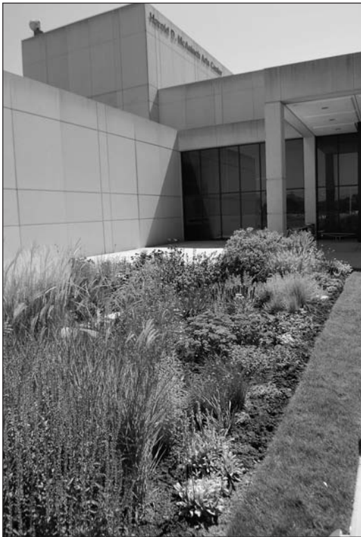
Sedum, ornamental grasses and summer beauty are among a mix of flowers leading into the MAC.

H ow much is too much curb appeal? Students around campus are taking shortcuts through planters or dodging water sprinklers. Though curb appeal does add atmosphere to certain areas of the college, many students do not have enough time to pay attention to the flowers.