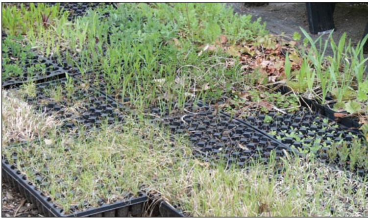
Bottom Right: Each one of these plants were grown from seeds collected from the prairie.