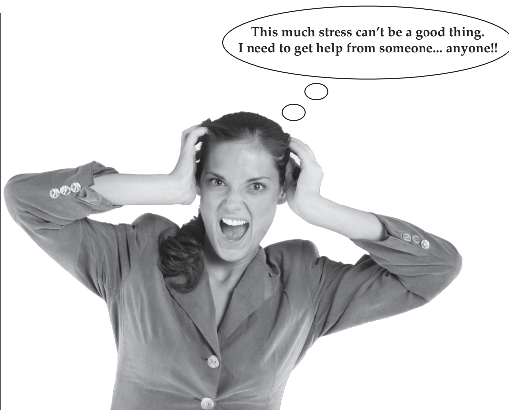
'stressed' from page 11

The Philanthropy Center is a partnership between the Donors Forum of Chicago and COD to meet the information needs of nonprofit organizations in the western suburbs. This event will begin a 9 a.m. on May 22 in SRC 2638 (in the Library). For more information and to register call (630) 942-3364.