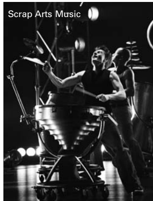
Scrap Arts Music

Saturday, Oct. 18, 8 p.m., $42/$32 COD students