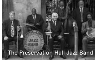
The Preservation Hall Jazz Band

Saturday, Oct. 11, 8 p.m., $40/$30 COD students