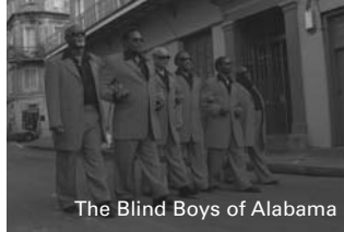
The Blind Boys of Alabama

Friday, Oct. 10, 8 p.m., $60/$50 COD students