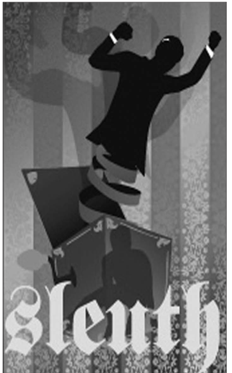
The official poster for the production of 'Sleuth.'