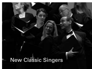
New Classic Singers