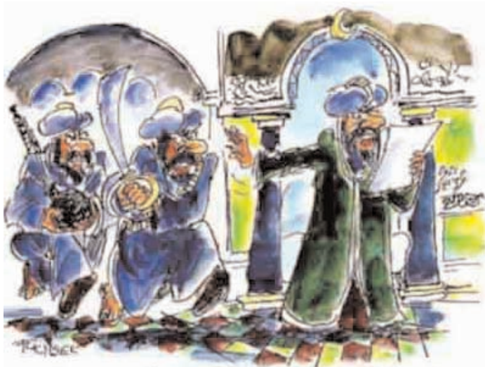
Relax, folks, it is just a sketch by a South Jutlander