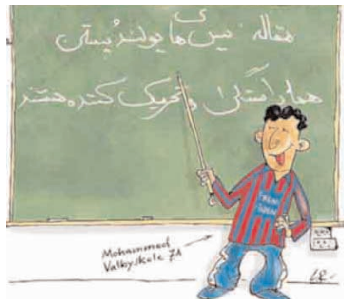
The board reads "The editorial team at Jyllands-Posten is a bunch of reactionary provocateurs."