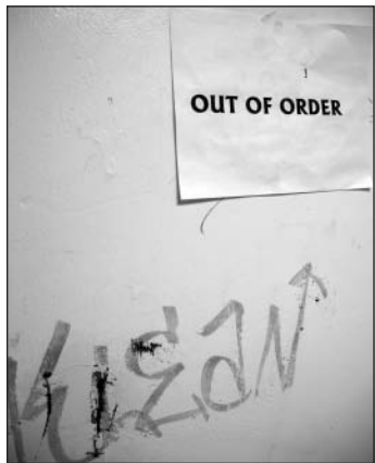
• Bathroom, IC 1056