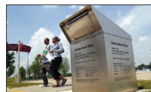
COD TODAY Library drop box located outside of the SRC building near Student Activities.