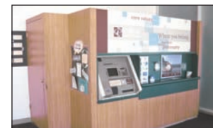
COD TODAY Credit Union ATM located outside of the cafeteria.

www.cod.edu/it/labs/pages/labhrs.htm#ACC .