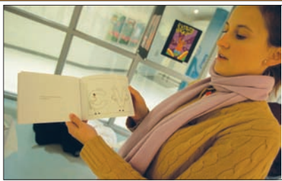
COD TODAY Advertising and Design Illustration student during "FEED" exhibit.