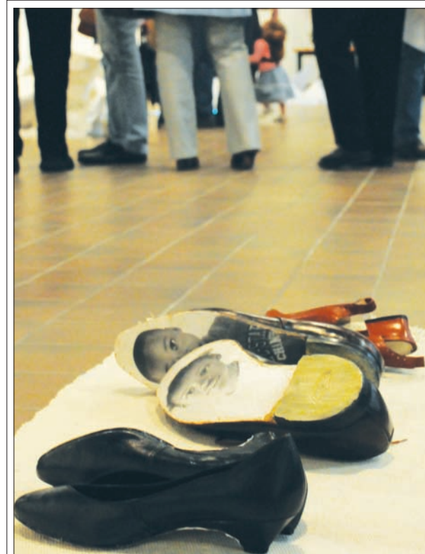
COD TODAY "Soles" during "The Annual Student Art Exhibit" held in the Gahlberg Gallery gives awards for outstanding work.

Studio Art Exhibit: An exhibit of new work by College of DuPage studio art faculty teaching painting, sculpture, drawing and design.