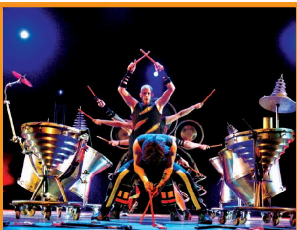
"Scarp Arts Music" uses instruments handcrafted from recycled scrap. They deliver wild theatricals and a powerful percussion performance.