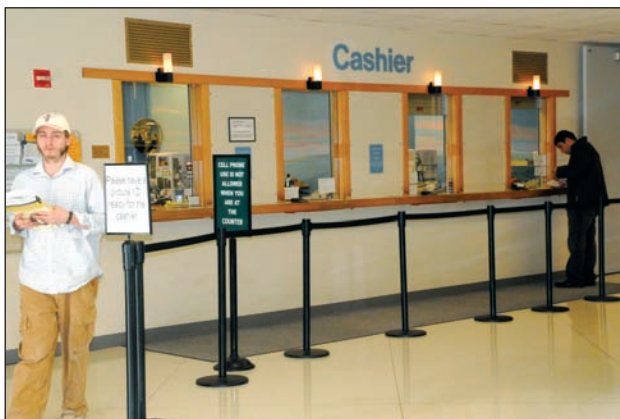
Students pay tuition and fees at the Cashier's office on the second floor of the SRC building.

Automatic Bank Payment automatically withdraws the money from checking or savings accounts every month. Credit cards offer alternative payment.