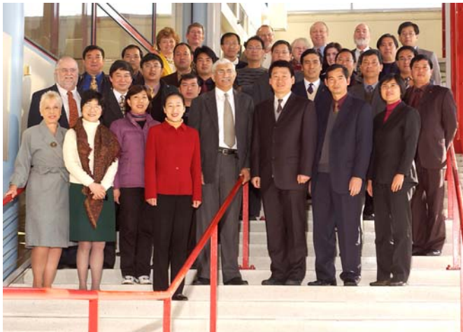
Yunnan Province Delegation with COD Hosts