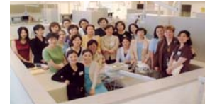
Korean Dental Assistant Delegation

June 24, 2003: A large Korean delegation visited the college to learn about the new Dental Assistant Program.