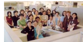
Korean Dental Assistant Delegation

June 24, 2003: A large Korean delegation visited the college to learn about the new Dental Assistant Program.