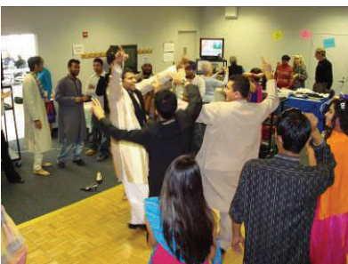
Asia Club/Indo-Pak-Bangla students celebrate at Passport to the World

The 8th Annual International Education Week, Nov. 12-15, 2007, was launched with the Study Abroad Fair which highlighted the many different study abroad opportunities available at the college. On Nov. 13 students got their passports stamped at Passport to the World , answered challenging question in Cultural Jeopardy , danced the