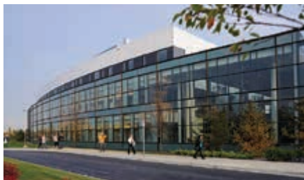
The COD Health and Science Center (HSC)

If you have been a patient at any time in one of the hospitals, clinics or other medical facilities in District 502, chances are you received care from a COD graduate. The College trains students to become nurses, X-ray technologists,