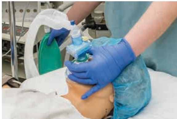
An Anesthesia Technology student learns to administer anesthesia using a high-fidelity mannequin.