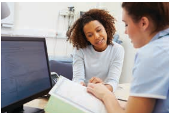
Students earning the Physician Office Coding and Billing certificate can find employment with physician offices, billing companies and insurance offices.

“Everyone starts off saying they want to be a nurse or a doctor, but that’s usually based off of a preconceived notion that those are the only options in the health care field,” she said. “I encourage my students to see what’s out there. With COD’s certificates being stackable, the training and experience you gain can be leveraged toward a higher-level career in the future.”